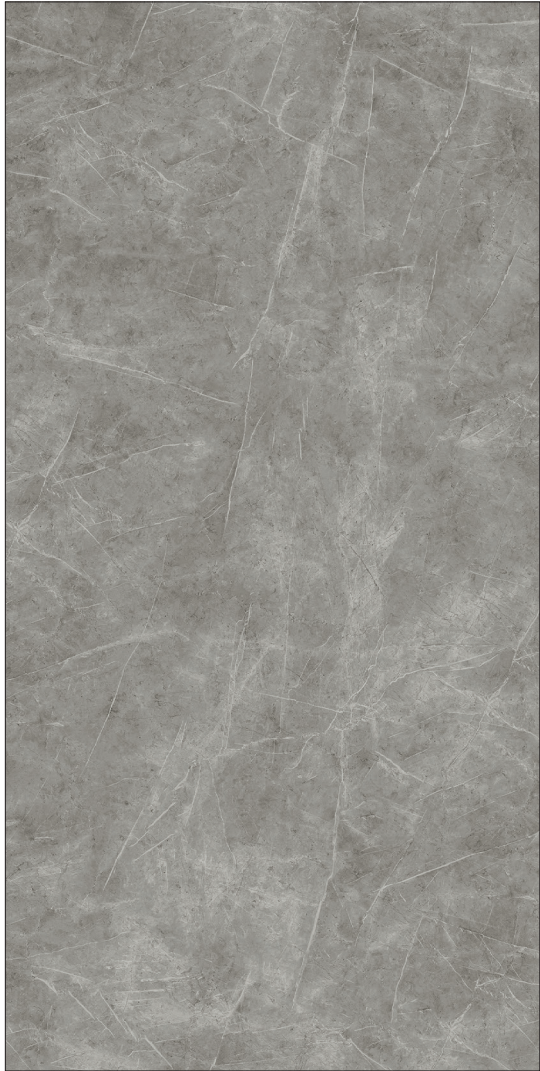
163 x 324 x 1.2 cm (64" x 128" x 0.5") Matte WA.MO.GSL.64x128.MT