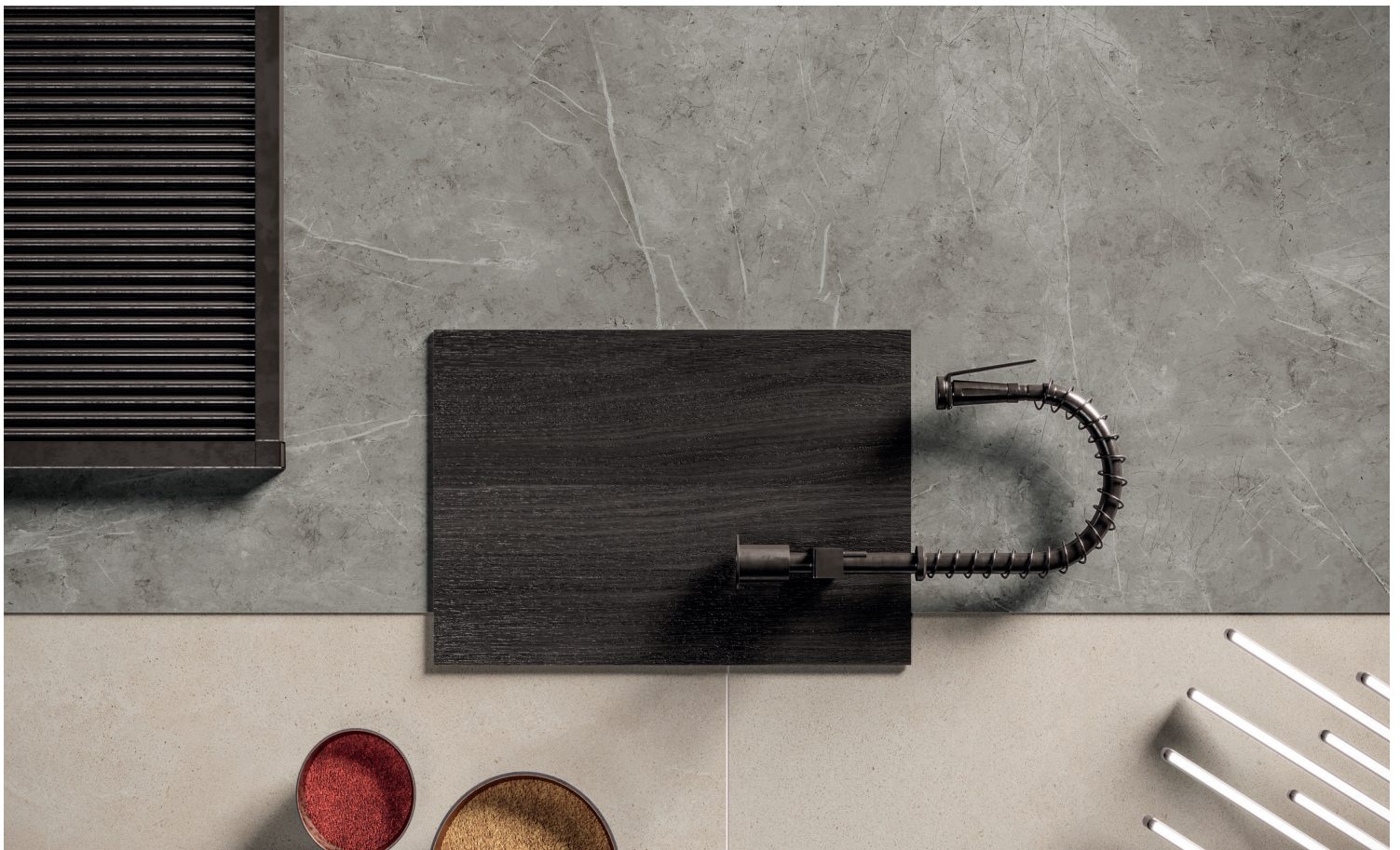
GREY STONE LIGHT