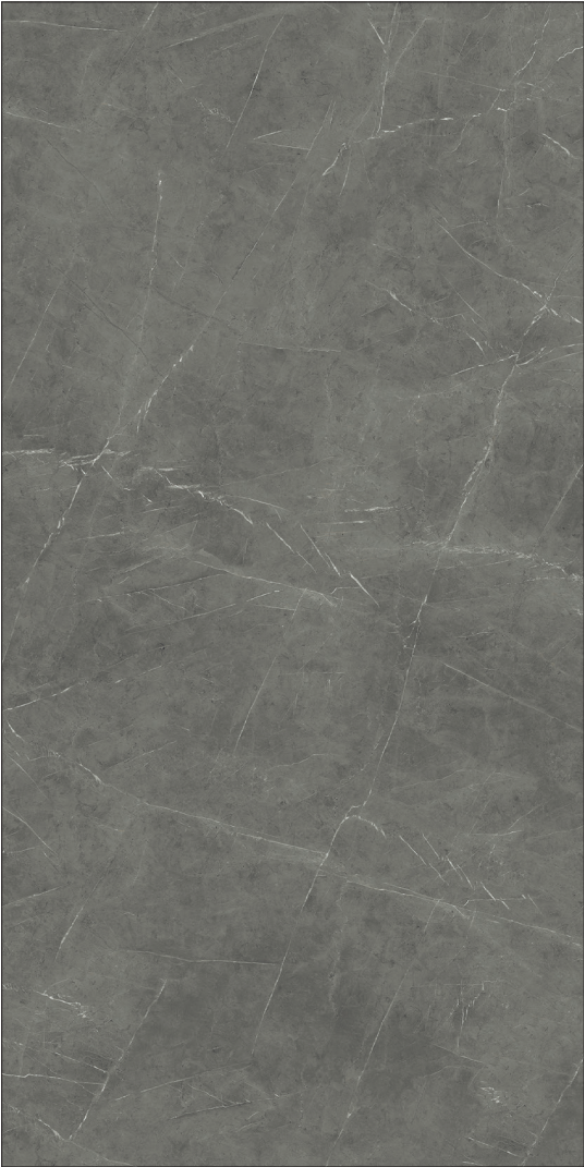
163 x 324 x 1.2 cm (64" x 128" x 0.5") Matte WA.MO.GST.64x128.MT

All items shown in this document are part of Olympia's stocking program. For special orders, please contact your Olympia Tile Sales Representative.